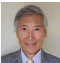
Prof. Dr. Chenming Hu TSMC Distinguished Chair Professor Emeritus, University of California, Berkeley